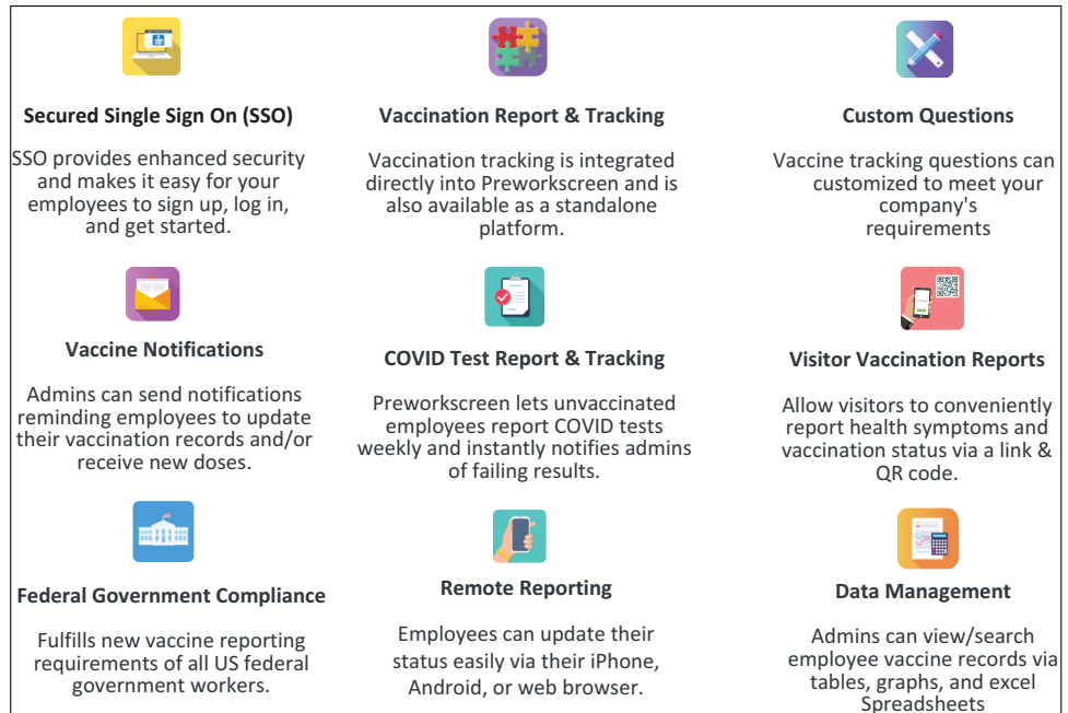
Figure 3: Vaccine & Testing Tracking Features

Figure 3 shows the key features implemented for vaccination and test tracking. Preworkscreen's iPhone & Android app allows employees to complete their COVID-19 self-assessments on the go. Note that our browser accesses via a company unique link also are mobile friendly for mobile phones, tablet, computers, etc., offering addition portability other than mobile app. SSO (Single Sign On) is provided for enhanced security and makes it easy for your employees to sign up, log in, and get started. It allows quick and batch employee enrollment to Preworkscreen system and allocates them into departments. Employees just simply log into the app, submit their response to our state-compliant COVID-19 self-screening or vaccination/test form, and the results will automatically be stored on the dashboard for HR/safety officers to access. Instant email/test notifications will be sent to HR/safety officers for critical events, such as non-passing employee testing and self-screening results.