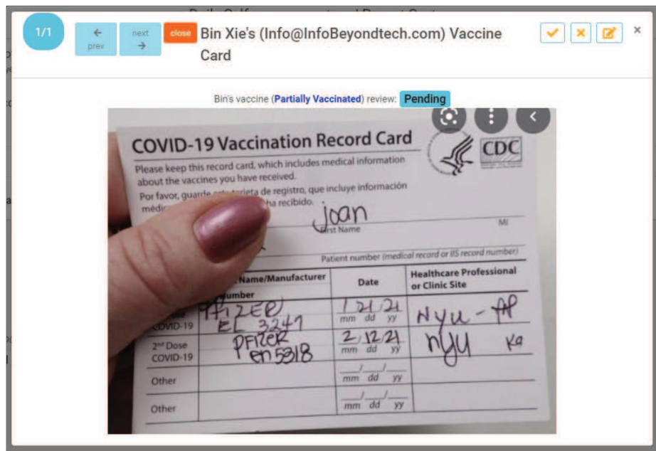
Figure 4: Vaccine card verification user interface

Preworxscreens is a user-friendly system for both employee/visitor and HR/safety officer who acts as administrators. Each company has a unique QR code that can be printed on papers, webs, social media, or displayed on e-devices at the office places. Corresponding to the QR code, a company link is also provided to distributing it to users by email and message. Preworxscreens offers a powerful dashboard for HR/safety officers to know the details as well as the overall health status of their work sites in real-time. It connects HR/safety officers and employees smoothly that is quick, safe, and responsible. From the dashboard, HR/safety officer can view/search employee self-screening/vaccination/test records via tables and graphs and export them in Microsoft Excel and PDF files. Self-screening/vaccination/test records can be searched and tracked for employees according to the name, employee ID, emails, etc. Figure 4 demonstrates the screenshot that allows HR/safety officers to review the details of the vaccination record and take actions, such as approve, reject, update, and modify the records subsequently. The updated status will be emailed to employee automatically. Furthermore, a HR/safety officer can write a reviewing note and immediately send it to the corresponding employee. Similar verification functions are provided for testing tracking.